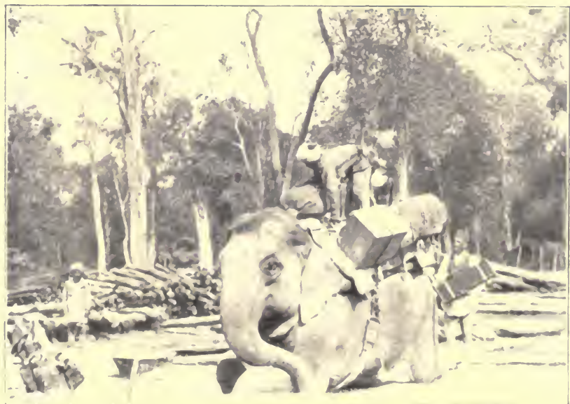
" AN ELEPHANT LOADED WITH MY STORES AND BAGGAGE."